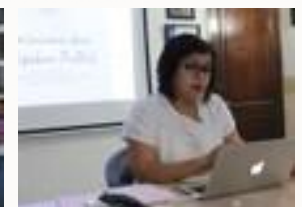
Public Policy and Women