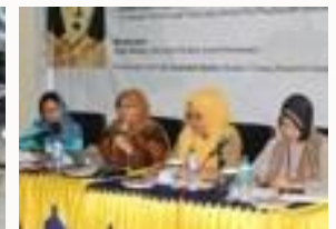
Public Education in Aceh